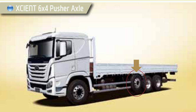
XCIENT 6x4 Pusher Axle