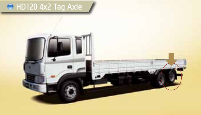
HD120 4x2 Tag Axle