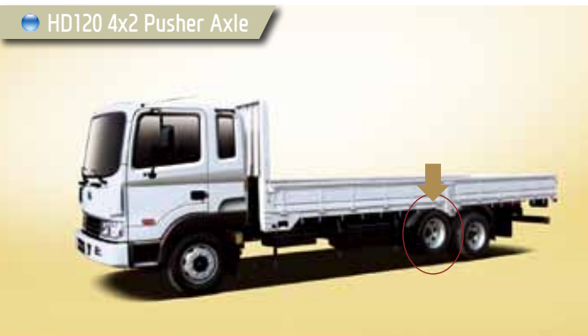
HD120 4x2 Pusher Axle